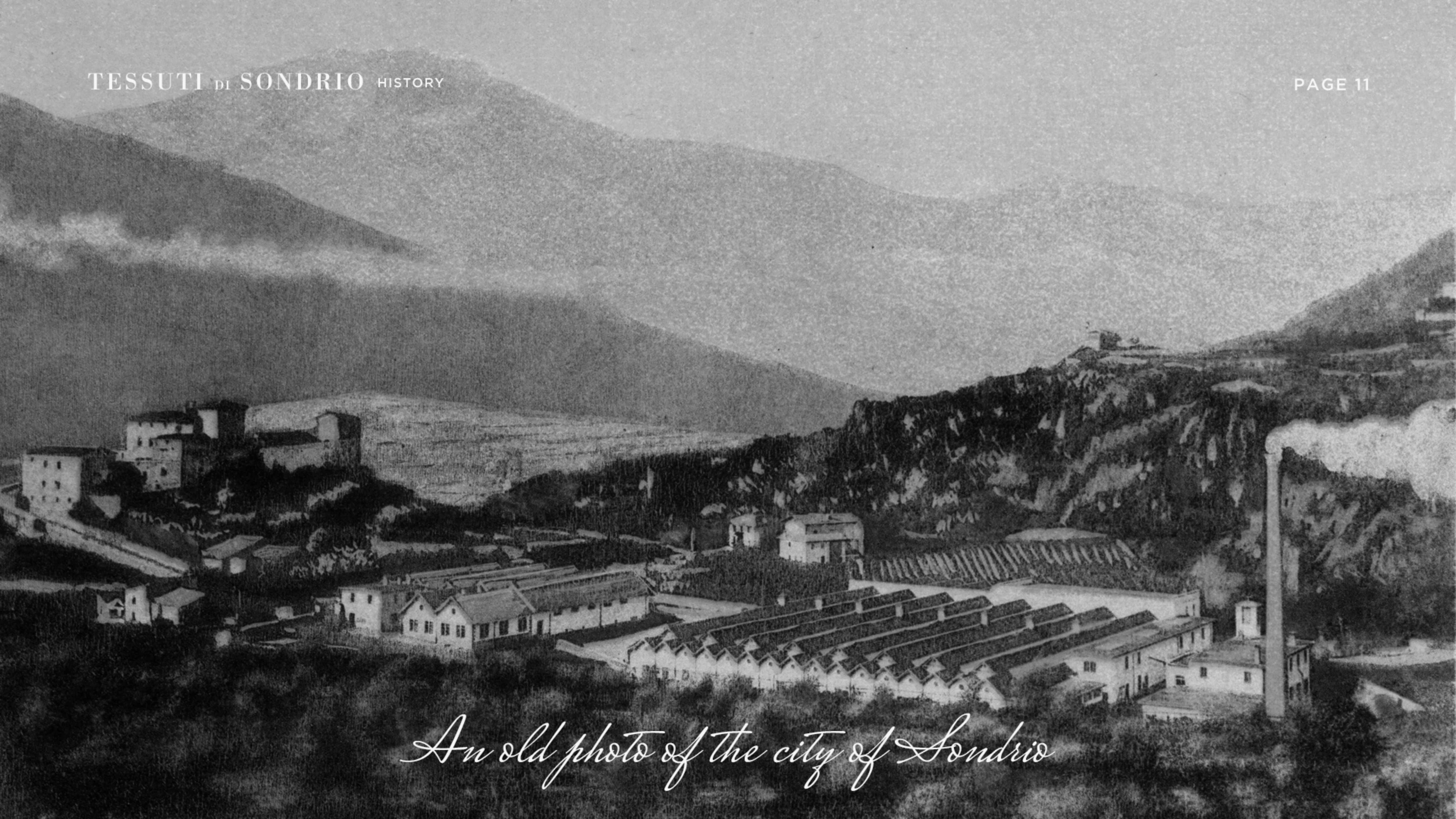
An old photo of the city of Sondrio